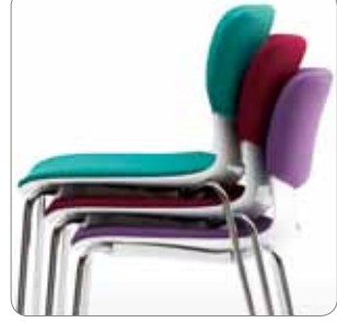
Stacking Stacking feature increases the space efficiency while bottom cover prevents the damage of seats. (Up to 4 chairs)