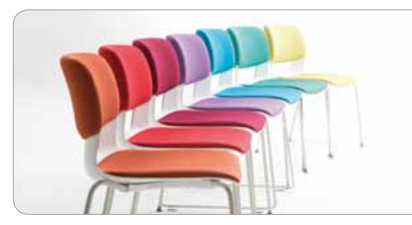
Delightful Colors A variety of color options enable you to create a delightful space.